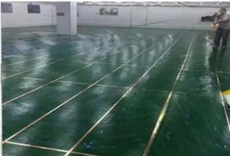
3. 铺设铜箔 Laying copper tape