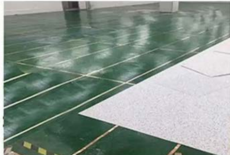
4. 铺装地板 Paved flooring