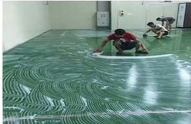
2. 刮涂胶水 Applying glue