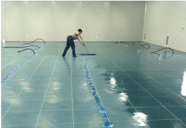
7. 表面涂蜡 Surface waxing