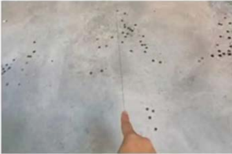
1. 清洁地面 Clean the ground