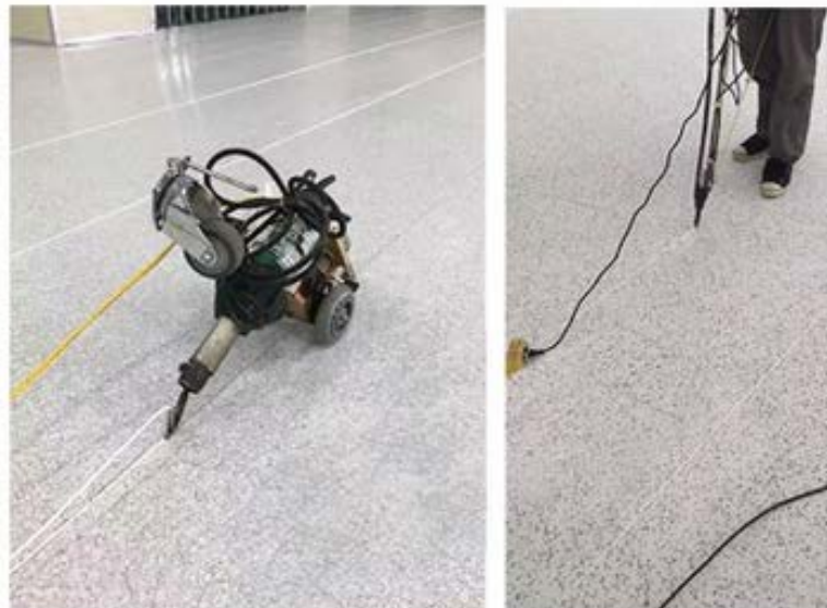
6. 焊接缝隙 Welding gap