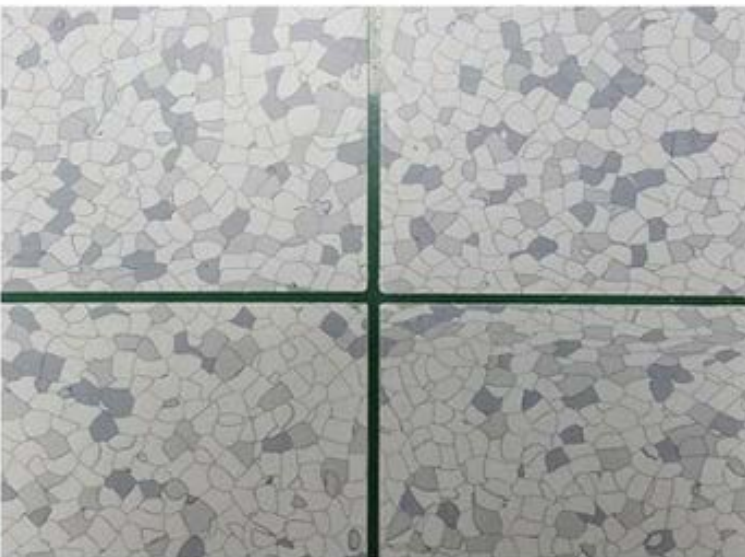
5. 预留缝隙 Reserved gap